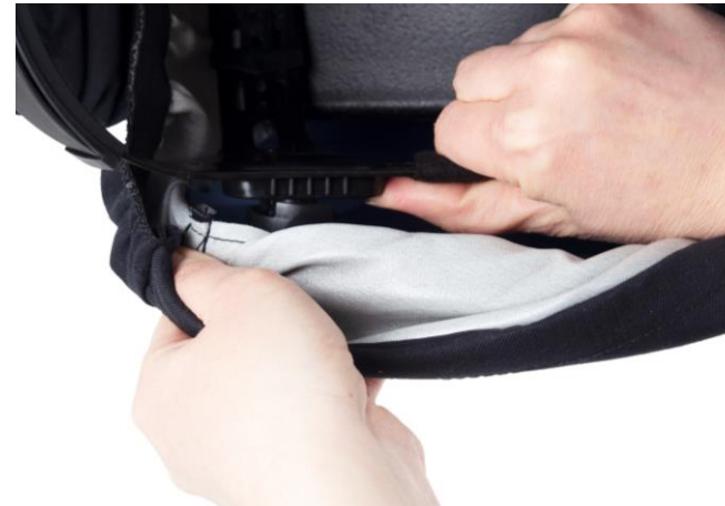
5.3 Space adjustment between shield and head harness. The space to the shield.