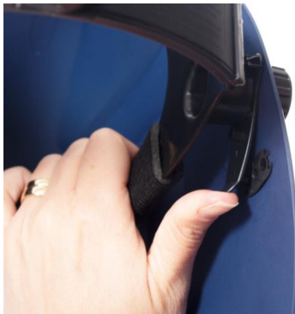
5.2 Angle adjustment between shield and head harness. The angle against the shield.