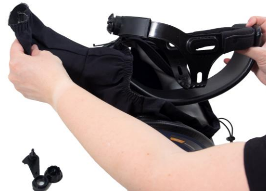
11.3 Fit the new face seal. Mount the face seal on the air channel.