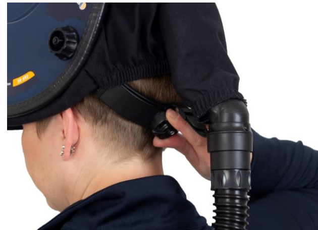
5.4 Width adjustment of the head harness. Adjustment of the width of the head harness.