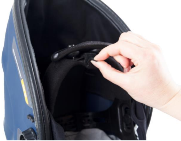
9.1 Remove the sweatband.