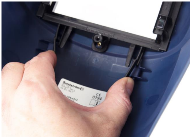
8.2 Release the holder for the welding filter.