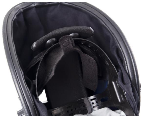
9.2 Fit the sweatband on the head harness.