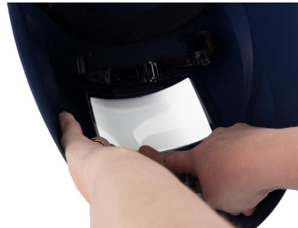
8.4 Fit the protective lens. Fit the holder. Tighten the screw.