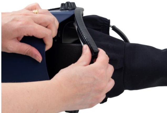
11.2 Remove the face seal.