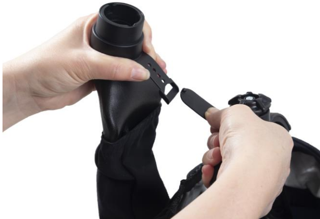
11.1 Release the air channel from the head harness.